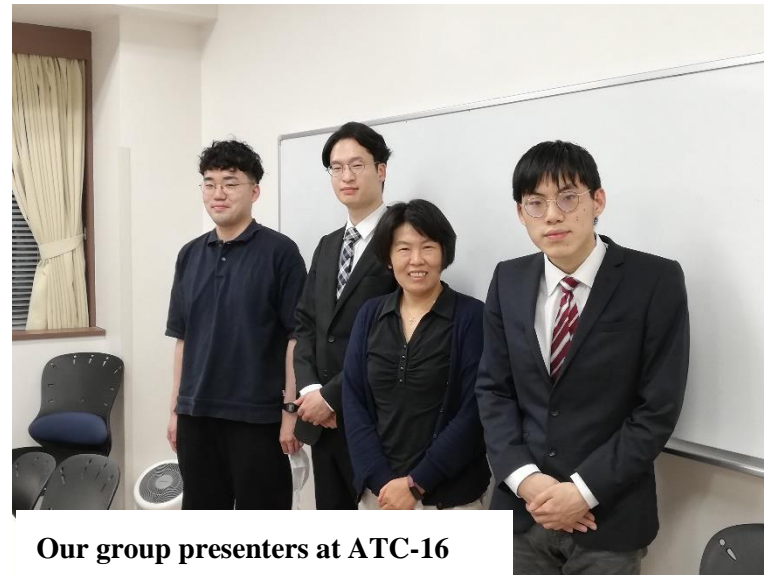
Our group presenters at ATC-16